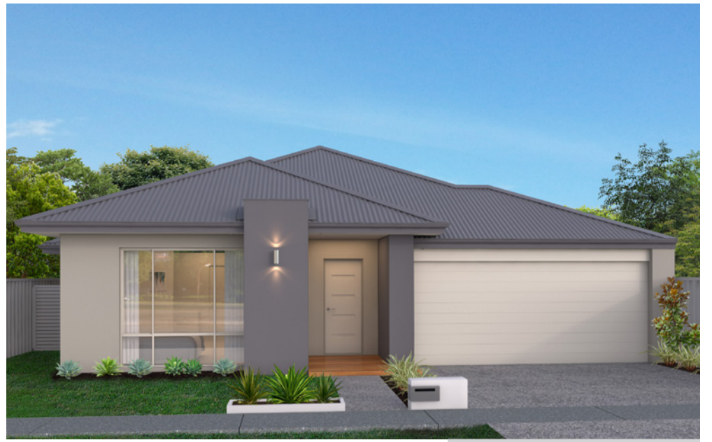
SUITS 15m FRONTAGE